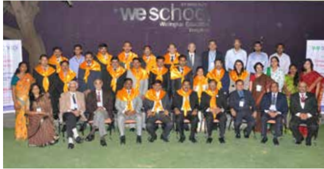
Convocation Ceremony of Post Graduate Program in Management Studies for Robert Bosch