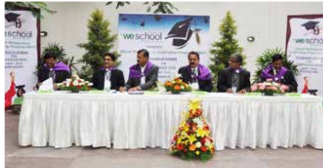
Junior Management Leadership Program (JMLP) Convocation Batch II