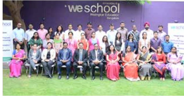
Certificate Program (Financial Accounting & Business Analytics) for EY GSS, Bangalore