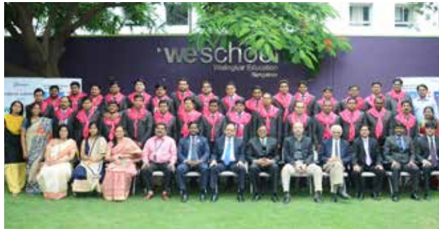
Advanced Course in Management for Biocon BFI