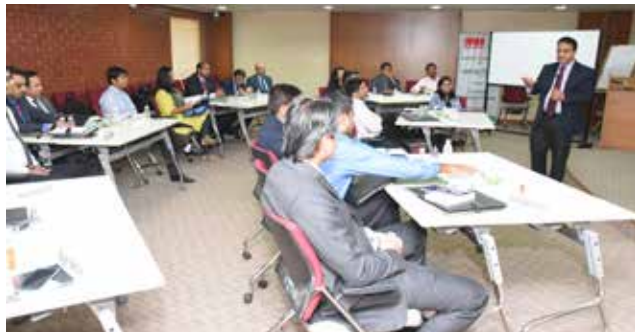
EDP Program for High Potentials for Adecco India Ltd. Interactive Session with Participants