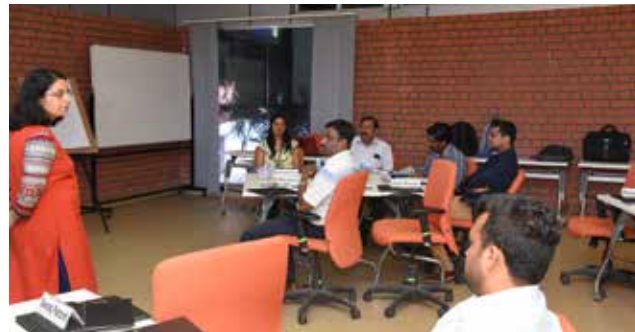
Professional Enrichment Program (PEP) for Continental Automotive Components Limited