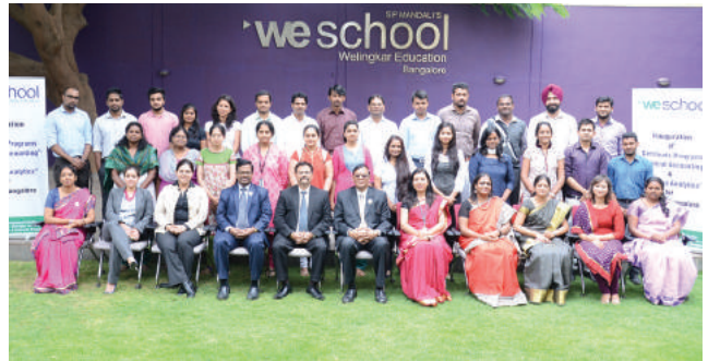
Certificate Program (Financial Accounting & Business Analytics) for EY GSS, Bangalore