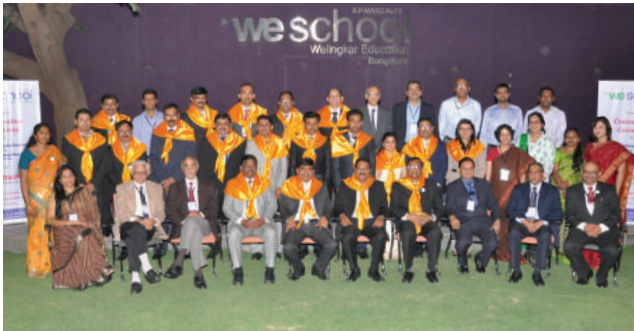
Convocation Ceremony of Post Graduate Program in Management Studies for Robert Bosch