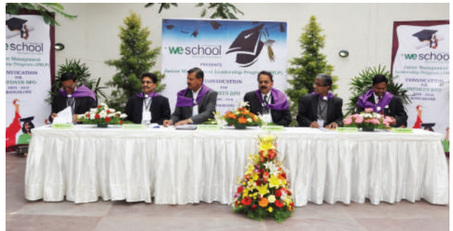
Junior Management Leadership Program (JMLP) Convocation Batch II