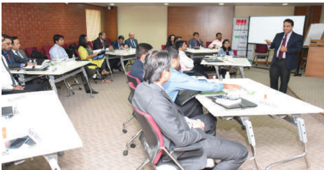
EDP Program for High Potentials for Adecco India Ltd. Interactive Session with Participants