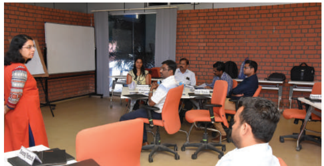
Professional Enrichment Program (PEP) for Continental Automotive Components Limited