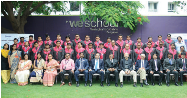
Advanced Course in Management for Biocon BFI